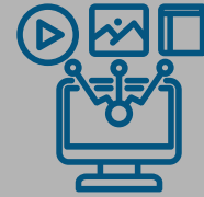
New Generation of Knowledge